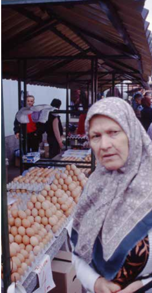
The ethnic dividing lines were more apparent in clothing customs after the war in Bosnia-Herzegovina. This photo is from Mostar in 1998.

It was a room for hope and joy and self-confidence, and the natural and incontestable choice of colour for those of us who were Norwegian, was green. Hope is light green. The associations brought by the optimistic photographs, the fine needlework, the broad opening onto the world, and the green colour would all merge into a greater unity of common understanding, common action, and common goals.