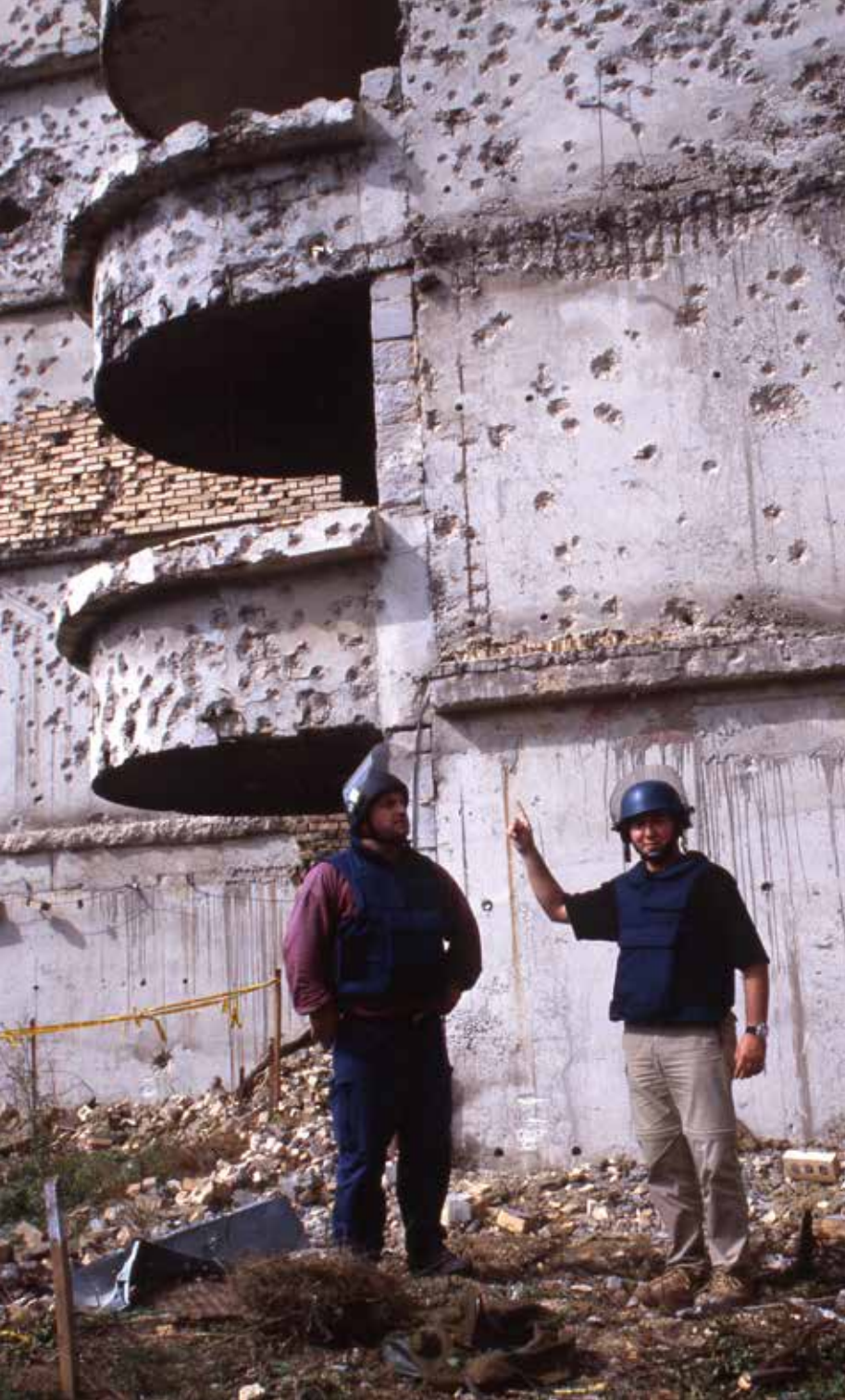
The war in Bosnia and Herzegovina was brutal and tragic. The scars of war are clearly visible on the border separating Serbian Orthodox and Muslim areas on the outskirts of Sarajevo.