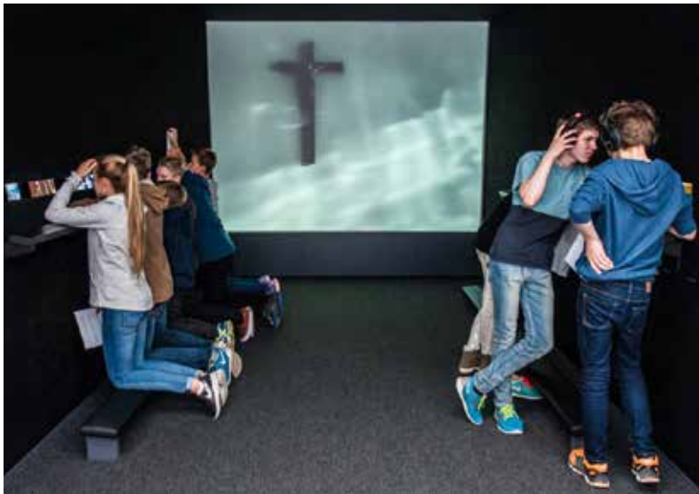
Dialogue in an exhibition is not just about dialogue between the disseminator and the visitors, but also about dialogue between the visitors and the elements of the exhibition. This is from the exhibition Homo Religiosus .