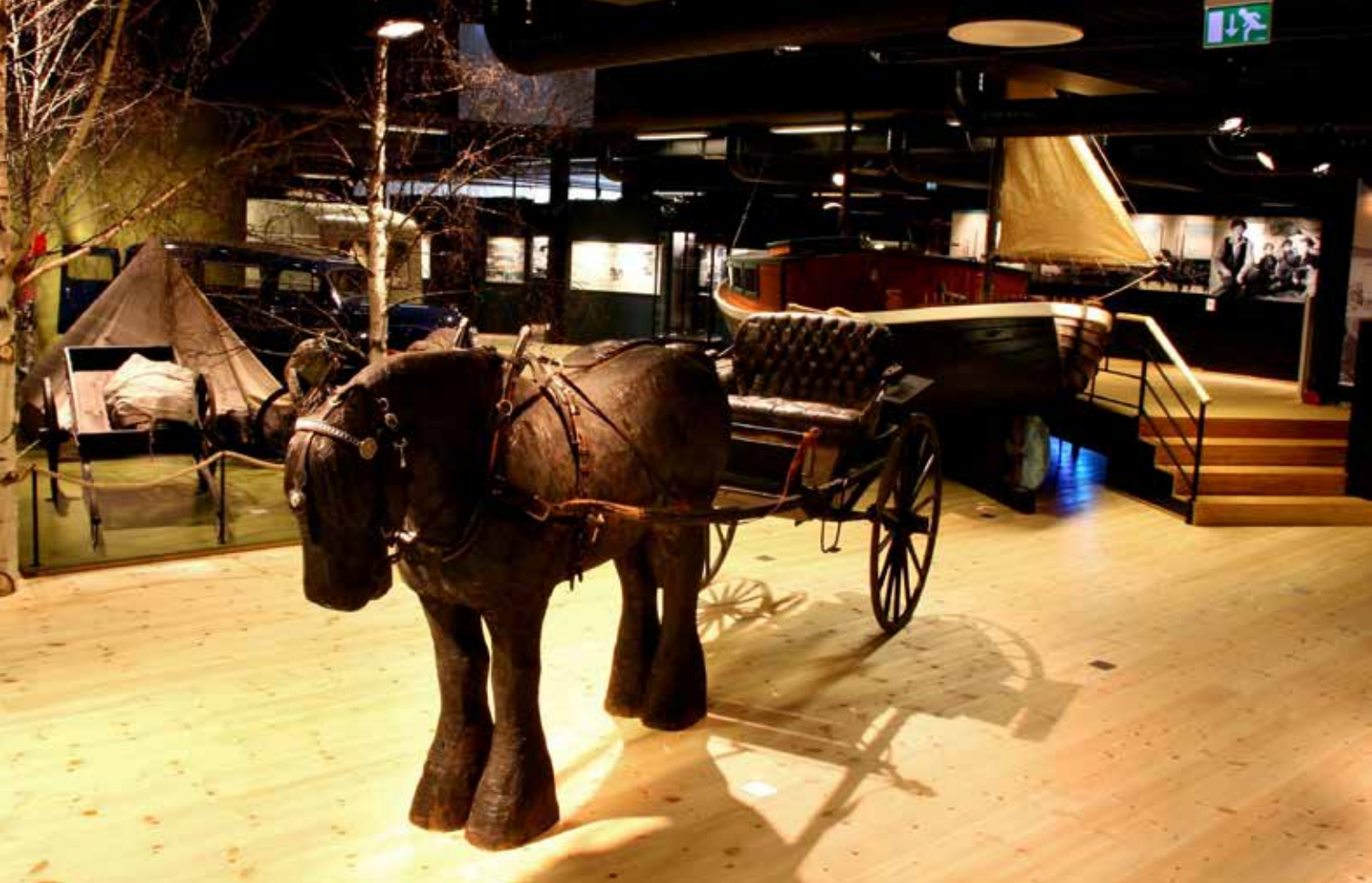
From the Latjo drom exhibition.

a central and unifying figure of Traveller descent from the South-Eastern part of Norway. She was one of the daughters of a leader of one of the most respected Traveller families in the region. 7