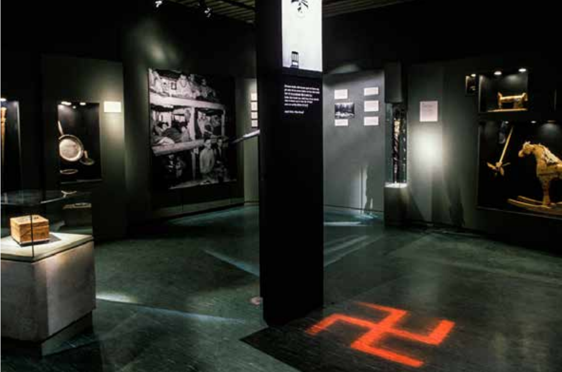
In the preparatory documentation for the exhibition Untermensch (1998) former prisoners of war and persons having memories of the camps were interviewed. In many cases, experienced were supplanted and the conversations made a strong impression.