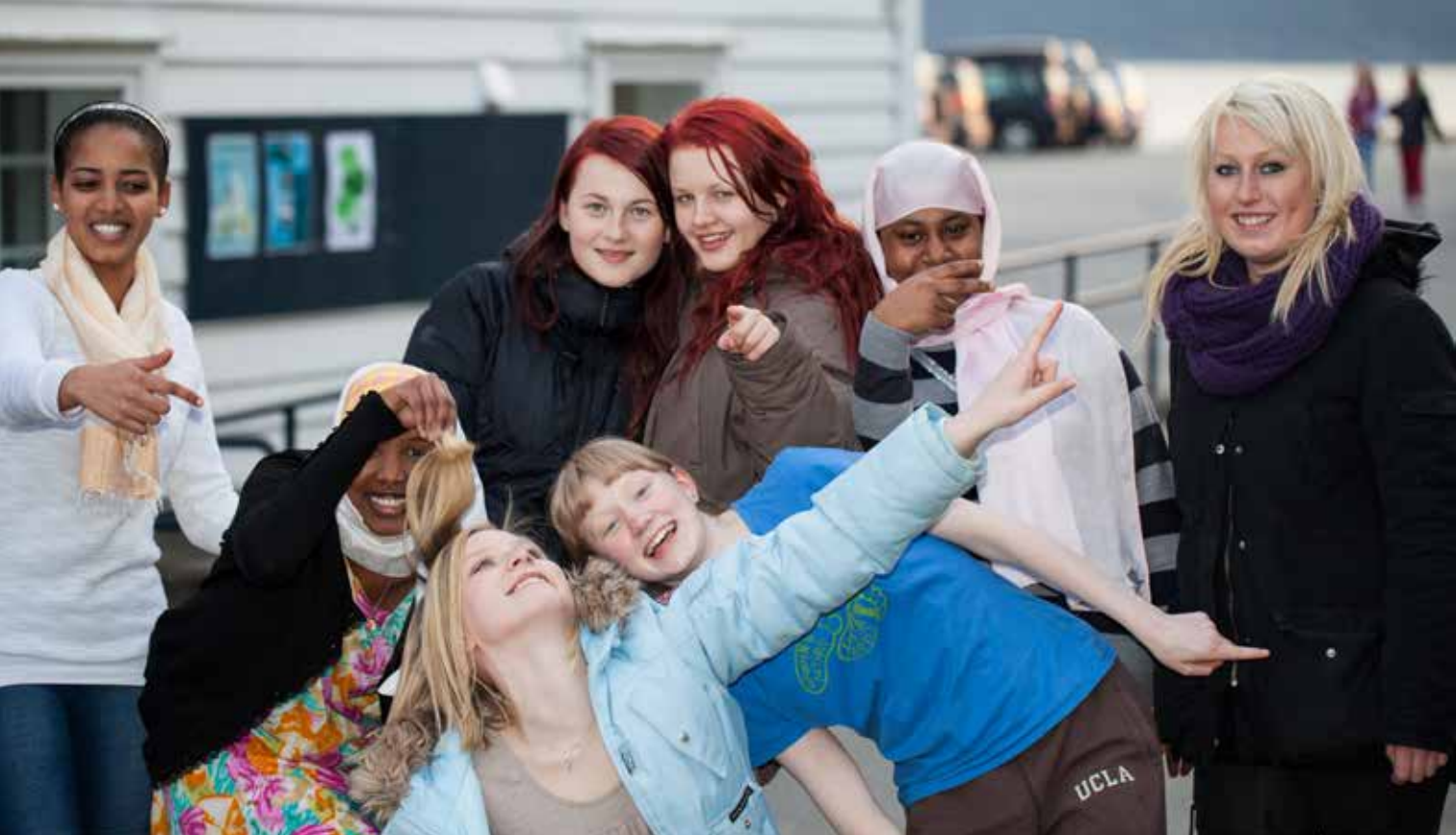
Ryfylke museum tries to include children and youth in its activities. The photo is taken after an international café.

municipalities in Ryfylke, both with immigrants, people who were close to the chapel/meeting house environment and others.