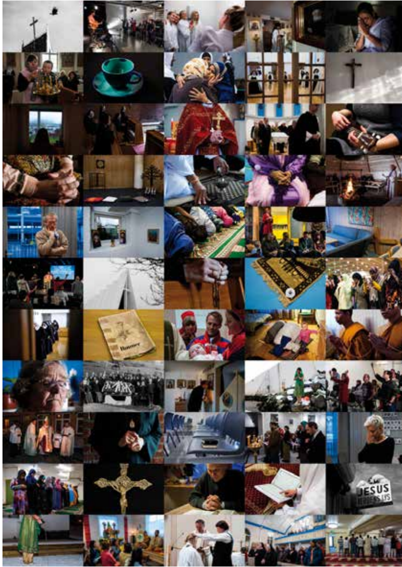
The documentation and exhibition projects at Perspektivet Museum take people living in Tromsø as their starting point. This makes it natural that both majorities and minorities are included. This demonstrates some of the religious diversity of the city.