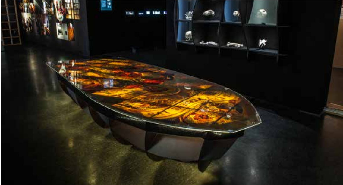
The exhibition Homo Religious.