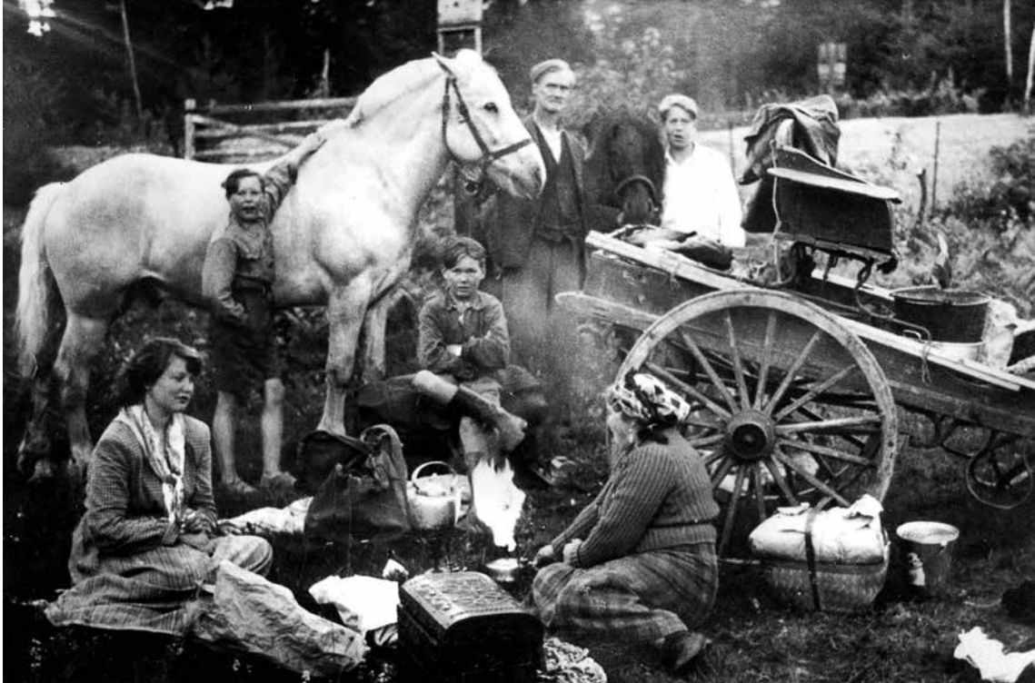
A family taking a break, about 1950 around Elverum.

the requirement that the museums were to keep the Government administration at an arm's length, but also when it came to which functions a museum may have. The planned project was directly tied to Government policies and the need for reparation, most likely in order to make Parliament understand the need for the initiative more easily. 10 The Travellers, on their