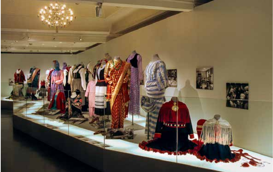
The exhibition Min drakt - Min historie was on display at Perspektivet Museum in 2005. The project provided a lot of experience of work with sensitive material.

"I don't usually talk loudly about these things"