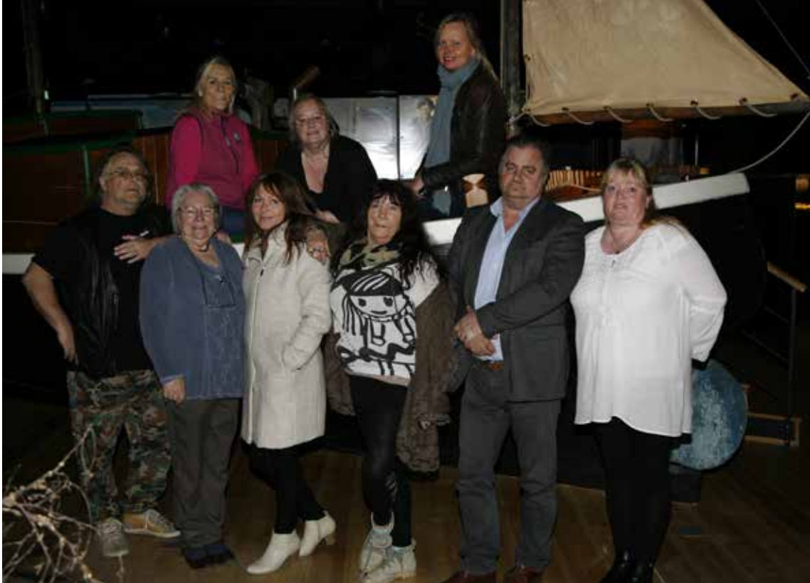
Photo of the work group in April 2016 in front to the boat in the Latjo drom exhibition.

process. Even though several project employees were of Traveller descent and were to be involved in presentation, the project had to be suspended because of resistance from parents descending from Traveller families at the project schools. 21 Had the project involved the National Trust of the