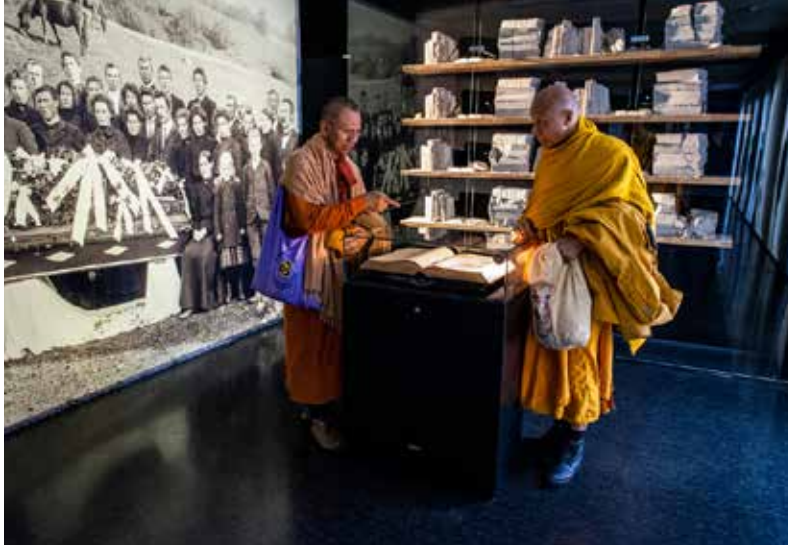
Visitors in the exhibition Homo Religious .