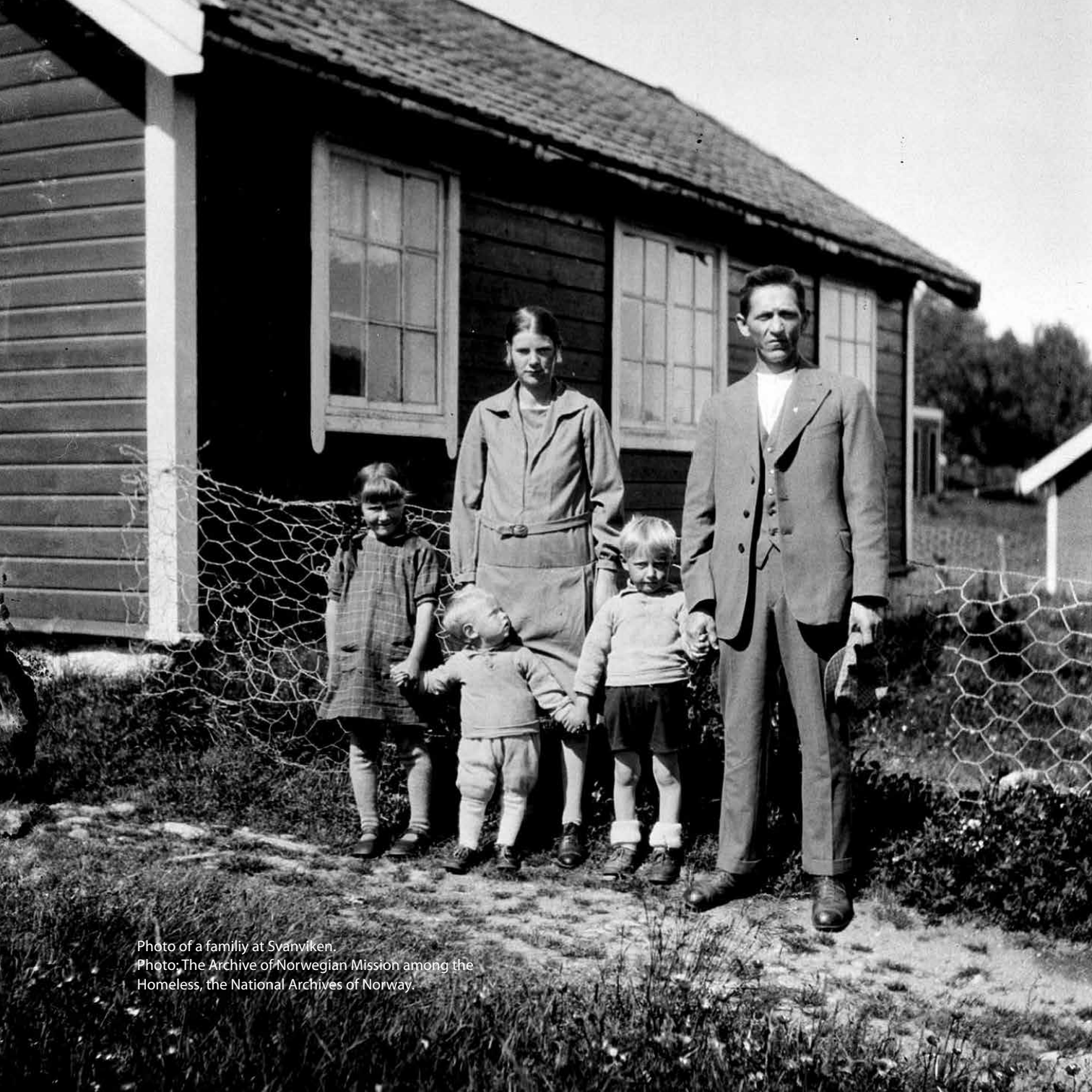
Photo of a family at Svanviken.